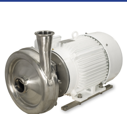
Alfa Laval LKH Centrifugal Pump