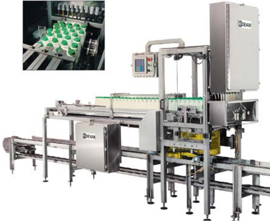
Round Bottle Caser with 16 oz. bottles in dairy case