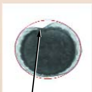
Product Integrity (Crushed Pie Tin)