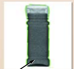
Glass in Glass