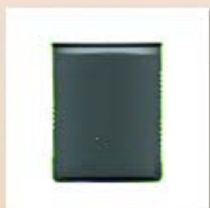
Metal in Metal