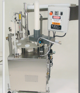
Rotary Cup Filler for 3 to 32 ounce sizes