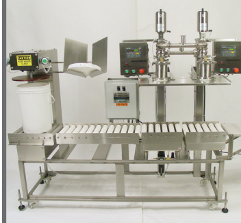
Semi-Automatic Liquid Scale Filler for 1 to 6 gallon sizes