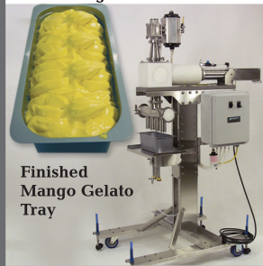
Finished Mango Gelato Tray