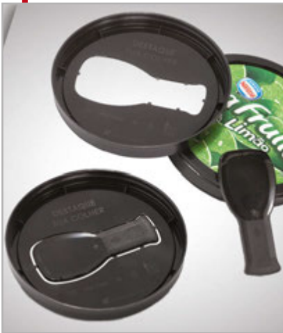
Source: "Spoon In Lid Packaging Market, Global Industry Analysis, Size, Share, Growth, Trends and Forecast 2017-2026," Transparency Market Research, Albany, N.Y.

That's the value the global spoon-in-lid packaging market is forecast to reach by 2026. The convenience-minded packaging solution is becoming popular for dairy products such as yogurt and ice cream, particularly in Europe.