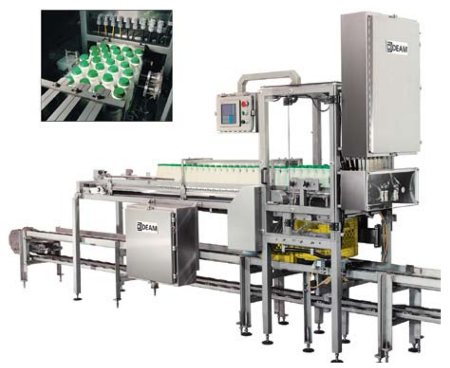
Round Bottle Caser with 16 oz. bottles in dairy case