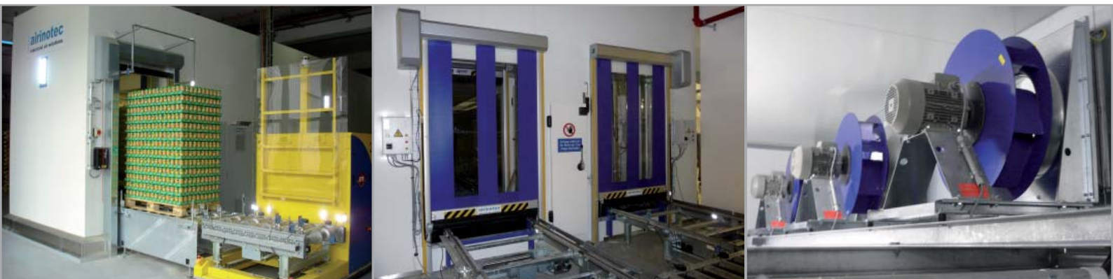
Cooling tunnel- one-lane version

Finding the most efficient solution requires not only technological know-how, but also comprehensive expertise in process technology. It is essential to analyze the status quo in the first phase of a project and to take into account future requirements, including growth aspects. We work with our customers to define the requirements for their pallet cooling system. On this basis, we analyze the products, evaluate the cooling behaviour of the pallet and look at ambient conditions and available space. Proceeding from a holistic system approach, airinotec's engineers will be able to suggest a tailored solution for each customer.