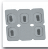
Blister Pack Inspection (Missing or broken tablets and contamination)