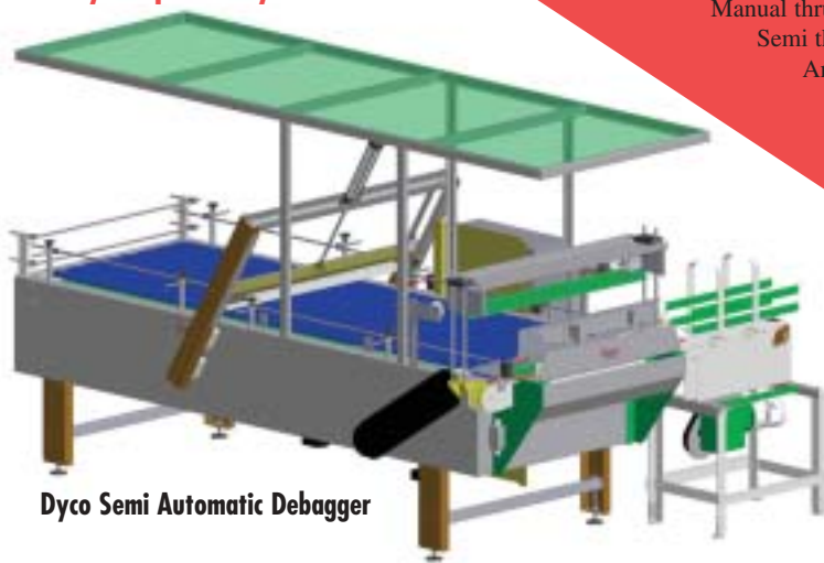
Dyco Semi Automatic Debagger