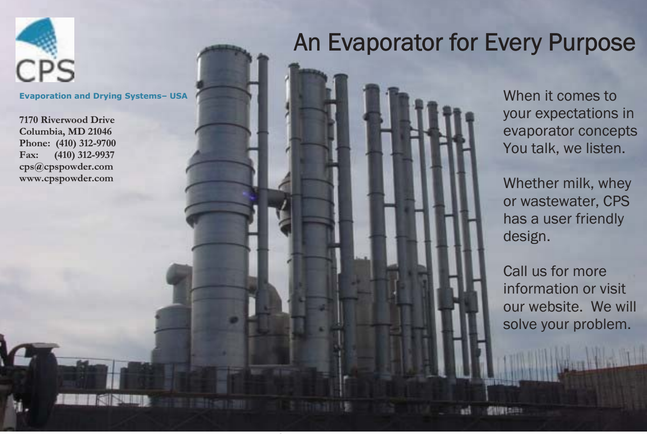
For information write in 312

Brands: Blue Bunny Products: Ice cream, novelties, cultured, milk Plants (5): LeMars, Iowa (2 ice cream & novelties, 1 milk & cultured); Omaha, Neb. (milk & cultured); Saint George, Utah