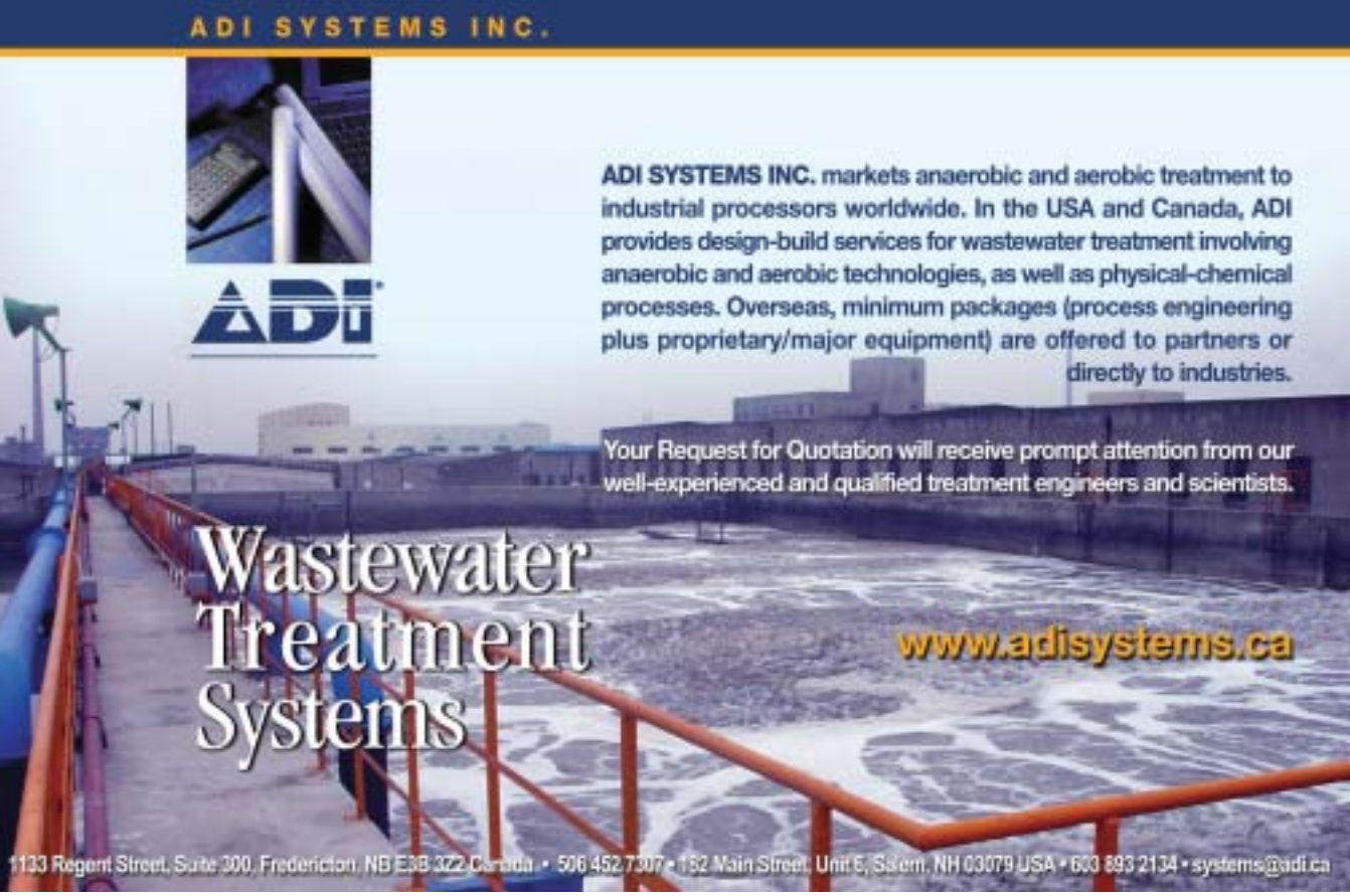
For information write in 314