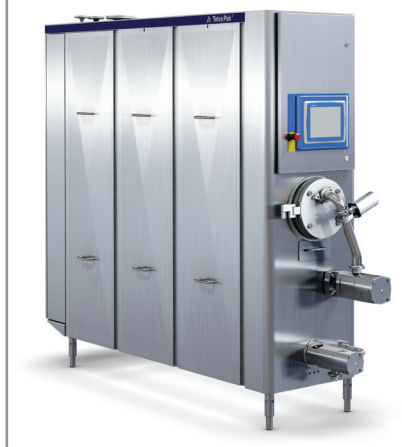
Tetra Pak® Continuous Freezer 2000 A2

thousands of plants in operation worldwide, and by a presence in more than 120 countries. At every stage of project management, from initial evaluation to plant handover, Tetra Pak® can take complete responsibility. From factory revamping to design and installation of complete new production lines, our capabilities range from food process engineering, controls, automation, to start-up training.