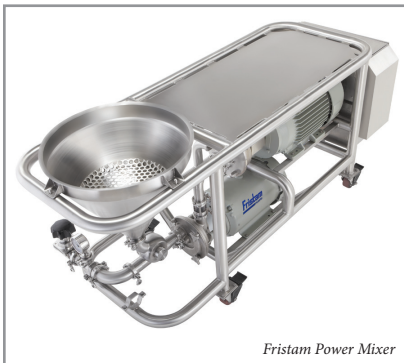
Fristam Power Mixer

2410 Parview Road Middleton, WI 53562 800-841-5001 www.fristam.com/usa