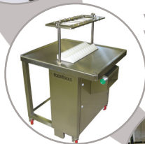
Vertical wire cutter for wheels, loafs or blocks.