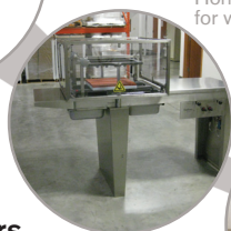
Horizontal / vertical wire cutter for wheels, loafs or blocks.