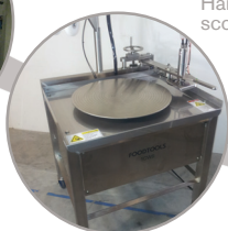
Hard cheese wheel scoring machine.