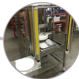
Vertical blade cutter for semi-soft or hard cheeses.

FoodTools wire & blade cheese cutters, designed & built to meet the dairy industry standards.