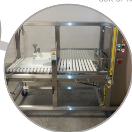
Horizontal wire cutter for soft or hard cheeses.